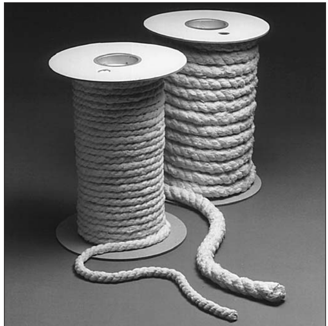
Fiberfrax Rope and HD Rope

Refer to the product Material Safety Data Sheet (MSDS) for recommended work practices and other product safety information.