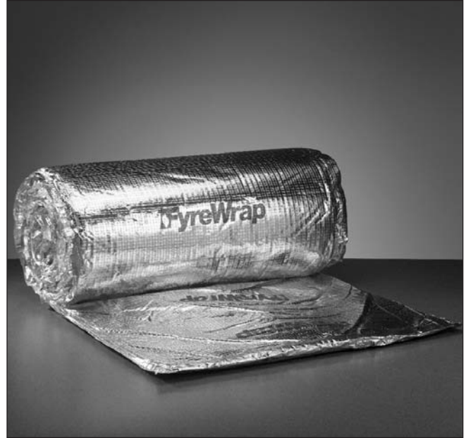
FyreWrap 0.5 Plenum Insulation

Core Material: FyreWrap 0.5 Plenum Insulation incorporates Insulfrax® Thermal Insulation as its core material. Insulfrax is a high-temperature insulation made from a calcia, magnesia, silica chemistry designed to enhance biosolubility. It provides excellent insulation in a noncombustible blanket product form.